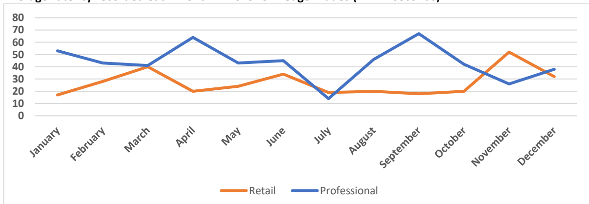
Average Latency recorded each month in 2023 for Hedge Trades (in milliseconds).

Our platform processes orders automatically without manual intervention, which maximizes the speed that it is executed. However, given the fast movements of the market, we monitor the latency of transactions by recording the average amount of time (in milliseconds) it took for orders to be fully executed each month.